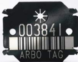
Fig. TYPE 08

The practical portable magazine with a capacity of 240 number tags in combination with the magnetic nail seat in the specially developed Arbo hammer makes it possible to quickly apply the tag to the trunk. Depending upon planting density, between 120 and 200 Arbo tags can be attached per hour. Fixing heights of 2.5 to 2.8 m are possible using the special extended hammer shaft. The tags are attached so high on the trunk that unauthorized removal is nearly impossible.