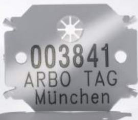
Fig. TYPE 08

Arbo tags are manufactured as sequential numbers in large quantities which allows a comparatively low-price. Modern cadastral tree registers always have the possibility of recording two numbers per tree: one that is actually fastened to the tree, an Arbo tag, and an additional number that corresponds to the natural tree control sequence. The star shaped cut-out guarantees that the tag grows with the tree.